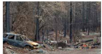
APTIM is helping rebuild California communities afflicted by the deadliest wildfire in state history.