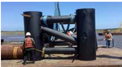
We designed the Houma Navigation Canal Lock Complex to protect Louisiana residents from saltwater intrusion and storm surge.