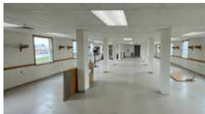
APTIM delivered 212 time-critical damage assessments and critical infrastructure restoration to bolster a national defense mission.